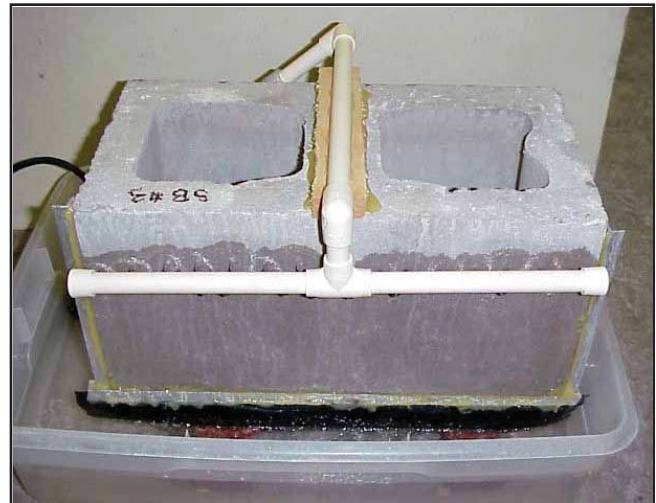
Figure 2—Specimen Undergoing the Spray Bar Test Method

While the water uptake test may be very good at distinguishing between the levels of resistance to absorption uptake, it will not indicate compaction or other flaws that might result in pinholes. Therefore, it is recommended that the results of this test be used to complement the results of the spray bar test and not used exclusively as a means of evaluation.