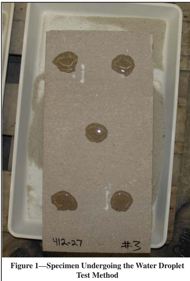
Figure 1—Specimen Undergoing the Water Droplet Test Method

All of these tests are suitable for evaluating units to be used in wall construction. It is important that field testing, if considered necessary, be conducted prior to wall construction since most of these tests can not be accurately performed on a constructed wall surface. For instance, small amounts of mortar left on the surface of a unit even after cleaning, as well as the cleaning techniques themselves, may alter the surface characteristics of the unit relative to its as-delivered condition. Similarly, water introduced into the system from grout or mortar (water of latency) and in turn absorbed into the unit may change the unit's characteristics. Before, after, or during construction, accumulated dust or pollution may also alter the surface characteristics. When water repellency characteristics are evaluated prior to unit placement, any unexpected results from field testing can be addressed in a timely manner using the default laboratory test methods described below.