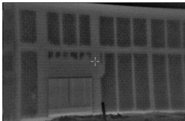
Figure 3—Infrared Photograph Used to Verify Proper Grout Placement

Borescopes (rigid optical scope) and fiberscopes (flexible optical scope) are useful for viewing interior void areas in a masonry wall. The scope is inserted into a small hole drilled into the wall, and can be attached to a camera or video recorder to document the observations. Borescopes and fiberscopes are often used to visually confirm anomalies detected using ultrasound, impact-echo or infrared methods, or to assess the condition of interior objects or cavities such as wall ties and collar joints.