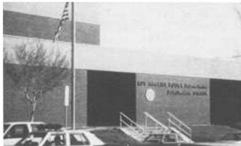
Los Angeles Police Department, Devonshire Station FIG. 1

Brick masonry is one of the oldest forms of building construction, and reinforcement has been used to strengthen masonry since 1813. In the modern sense reinforced brick masonry in the United States is a relatively new type of construction, with specific design procedures and construction methods. These have been developed from experimental investigations beginning in the 1920's and with the experience of the performance of thousands of reinforced masonry buildings. These structures demonstrate the practicality and economy of the construction, and their performance confirms the soundness of the design principles. Figure 1 shows the Los Angeles Police Department, Devonshire Station, a reinforced brick structure, located 3 miles (4.8 km) from the epicenter of the Northridge earthquake. There was no structural damage and the building reportedly functioned as an emergency services coordination center following the 6.7 magnitude earthquake.