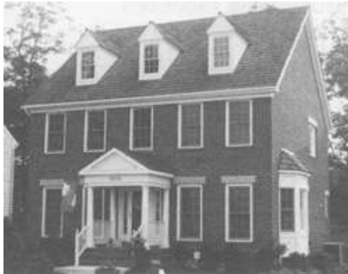
Reinforced Brick Masonry Single Family Residence, Ashbrun VA FIG. 6

Structures of all sizes, from single story residences to 23 story buildings have been constructed of reinforced brick masonry as shown in Figs. 6 and 7.