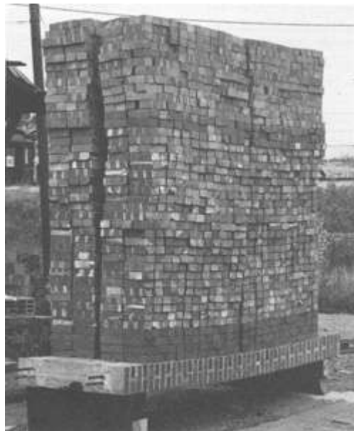
Early Test of RBM Element FIG. 2

Research in the United States, sponsored by the Brick Manufacturers Association of America and continued by the Structural Clay Products Institute and the Structural Clay Products Research Foundation contributed much valuable material to the literature on reinforced brick masonry. Since 1924, numerous field and laboratory tests have been made on reinforced brick beams, slabs and columns, and on full size structures. Fig. 2 is an example of a 1936 test to demonstrate the structural capabilities of reinforced brick masonry elements.