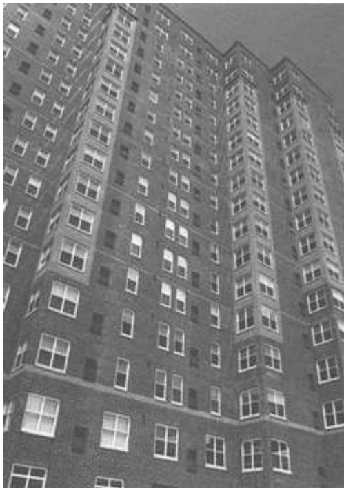
Reinforced Brick Masonry High Rise, Cleveland, OH FIG. 7

The applications range from retaining walls to exterior cladding. The added tensile strength of the reinforcing steel opens the possibility for prefabricated brick panels. This method of design and construction is utilized frequently to achieve unusual shapes and bond patterns in brick masonry. See Fig. 8.