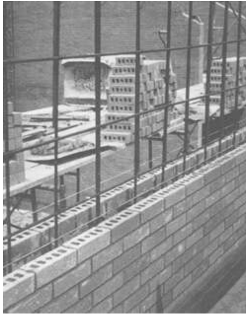
Double Wythe Reinforced Brick Masonry FIG. 3

The most recent means of constructing reinforced masonry incorporates hollow brick. These units are manufactured with large open cells which align vertically when the units are laid. Vertical reinforcement is placed in the cells by laying the brick over or around the bars, or by threading the bar in after the brick are laid. Horizontal reinforcement is placed in bed joints or in continuous bond beams made by removing portions of the webs that connect the face shells. Spaces containing reinforcement are grouted in lifts of up to 5 ft (1.5m) to make grout pours of up to 24 ft (7.3m). Construction of reinforced hollow brick masonry is shown in Fig. 4