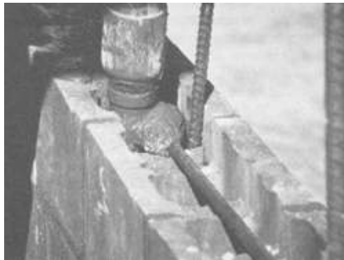
Reinforced Hollow Brick Masonry FIG. 4

The most recent means of constructing reinforced masonry incorporates hollow brick. These units are manufactured with large open cells which align vertically when the units are laid. Vertical reinforcement is placed in the cells by laying the brick over or around the bars, or by threading the bar in after the brick are laid. Horizontal reinforcement is placed in bed joints or in continuous bond beams made by removing portions of the webs that connect the face shells. Spaces containing reinforcement are grouted in lifts of up to 5 ft (1.5m) to make grout pours of up to 24 ft (7.3m). Construction of reinforced hollow brick masonry is shown in Fig. 4